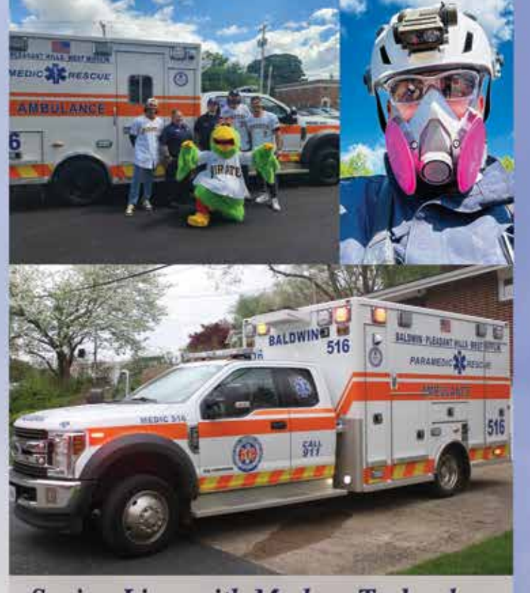
Saving Lives with Modern Technology and Meeting Today's New Challenges